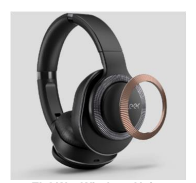
FLOW – Wireless Noise Canceling Headphone

The FLOW – Wireless Noise Canceling Headphone delivers best-in-class wireless noise canceling performance (up to 30dB